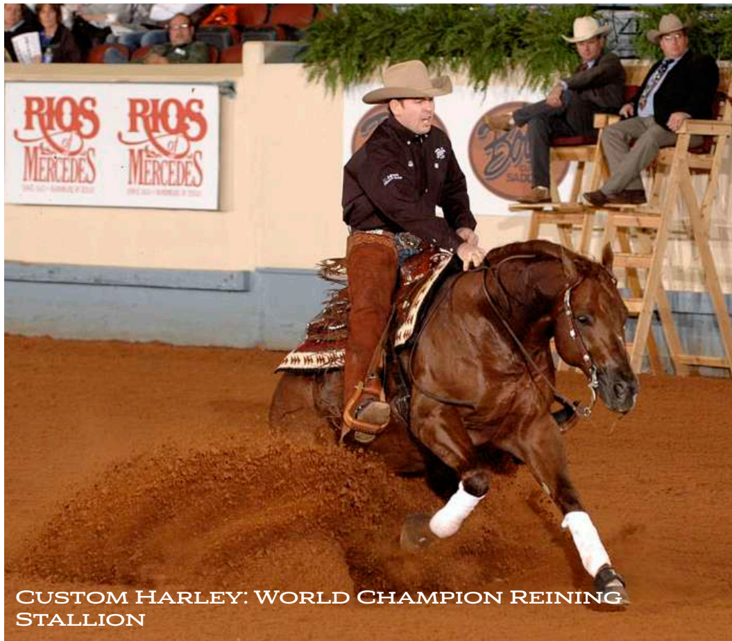
CUSTOM HARLEY: WORLD CHAMPION REINING STALLION