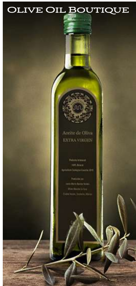
OLIVE OIL BOUTIQUE