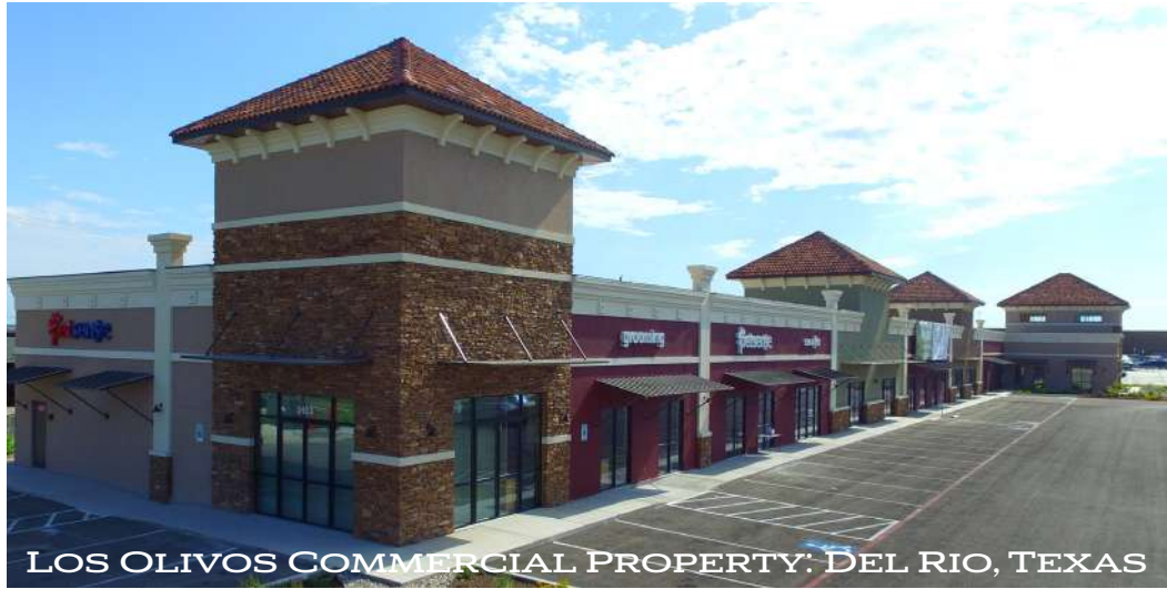
LOS OLIVOS COMMERCIAL PROPERTY: DEL RIO, TEXAS