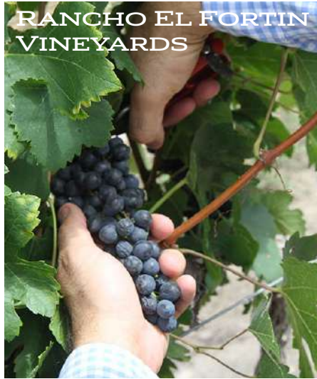
RANCHO EL FORTIN VINEYARDS