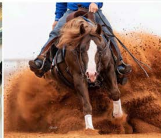
Rancho El Fortín