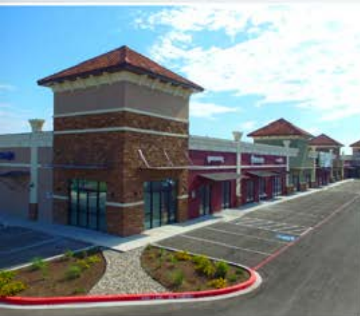
Commercial Real Estate

Amistad is the only family-owned development company in Mexico of its size, stature and experience. That means you get superior service and excellent product because our name depends on it. We are a passionate family — and that passion doesn't stop with taking your company to the next level. Our clients often enjoy experiencing the fruits of our other labors, whether for business or pleasure. From logistics, retail and ranching, to wine and olive oil production, Amistad invites you to begin a fulfilling partnership.