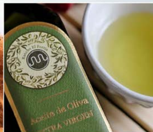
Olive Oil Production