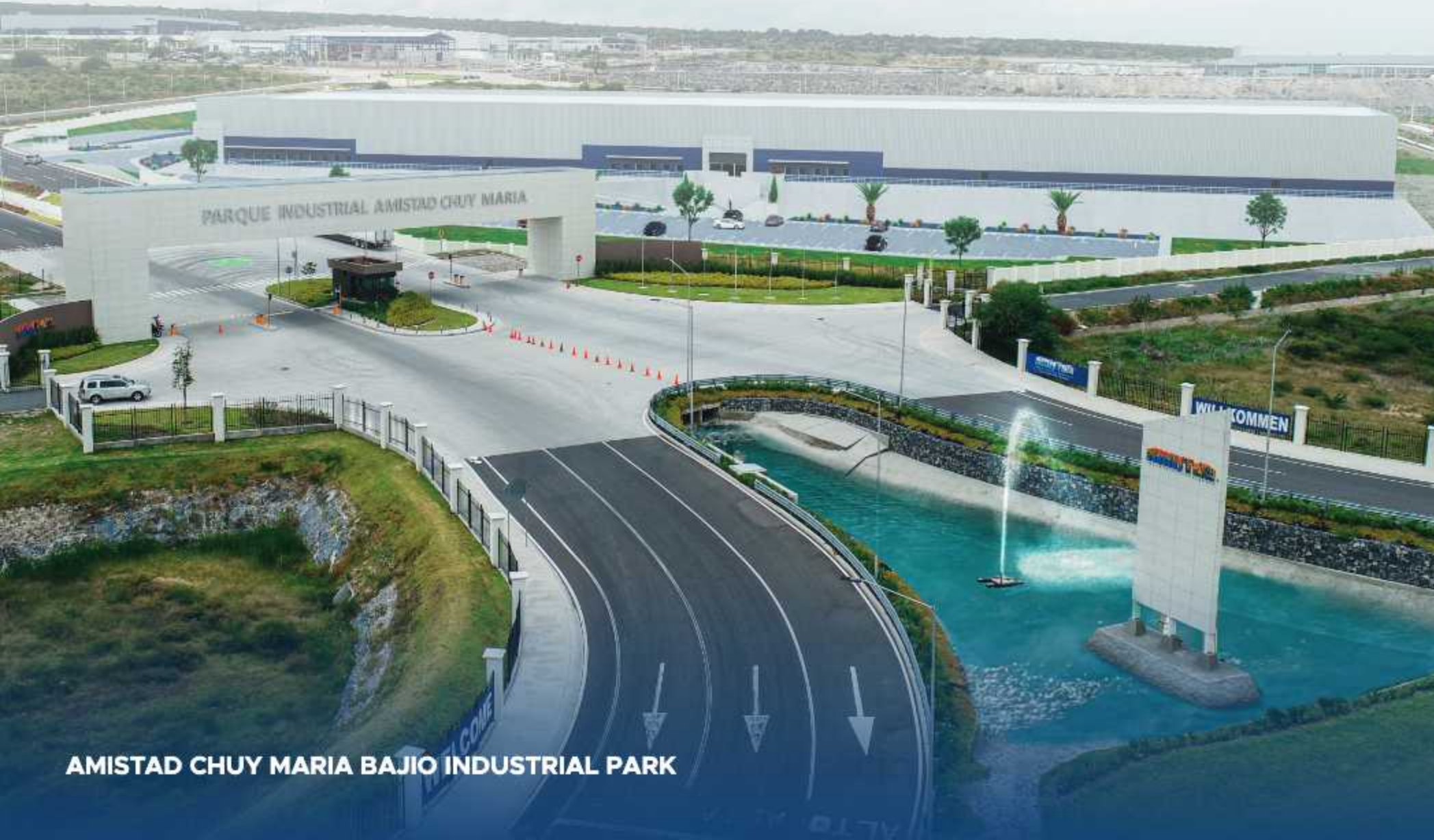
AMISTAD CHUY MARIA BAJIO INDUSTRIAL PARK