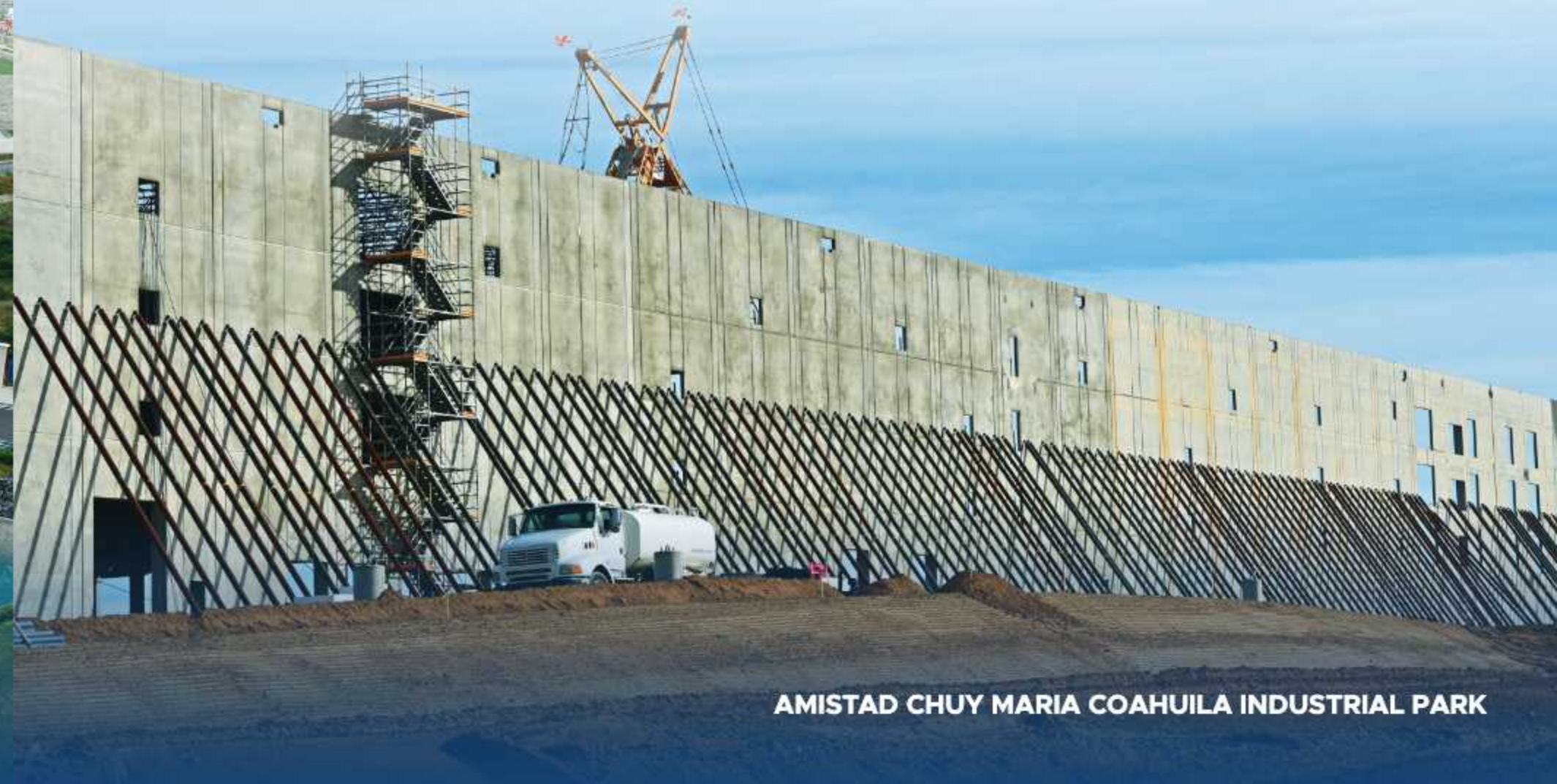
AMISTAD CHUY MARIA COAHUILA INDUSTRIAL PARK

CONSTRUCTION MANAGEMENT IN-HOUSE DESIGN & ENGINEERING TURN-KEY CONSTRUCTION BUILT-TO-SUIT FACILITIES