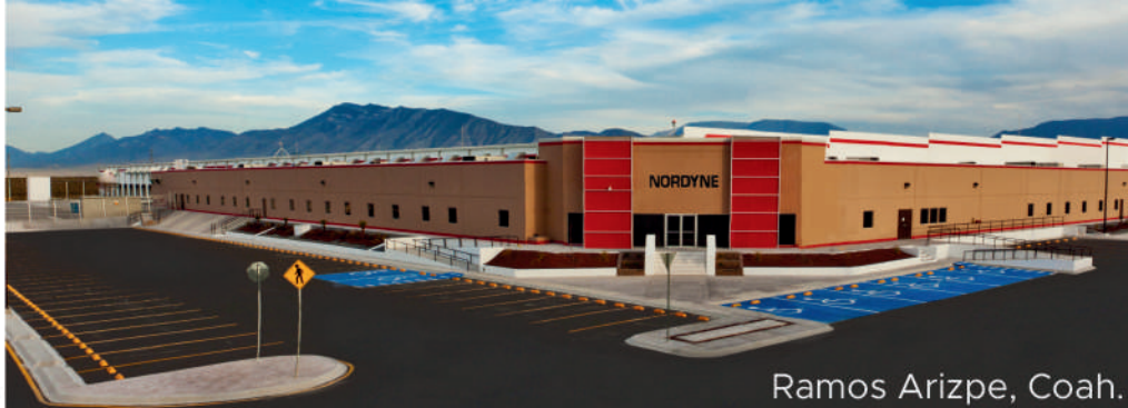
Ramos Arizpe, Coah.