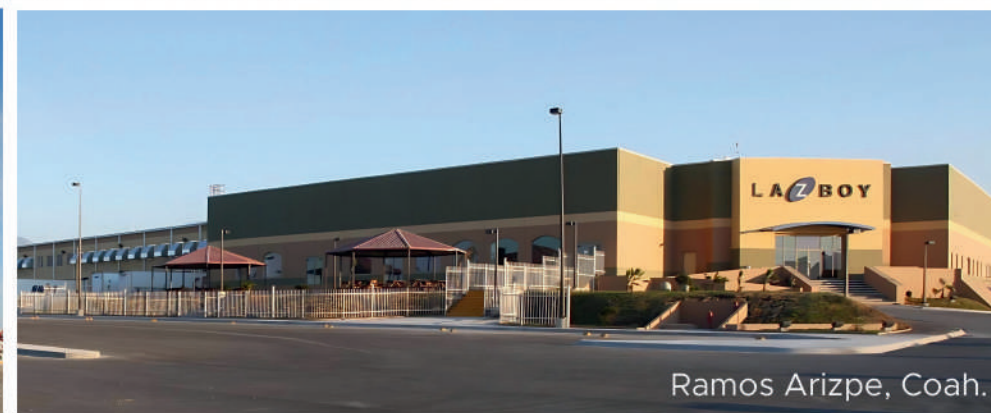
Ramos Arizpe, Coah.