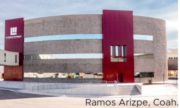
Ramos Arizpe, Coah.